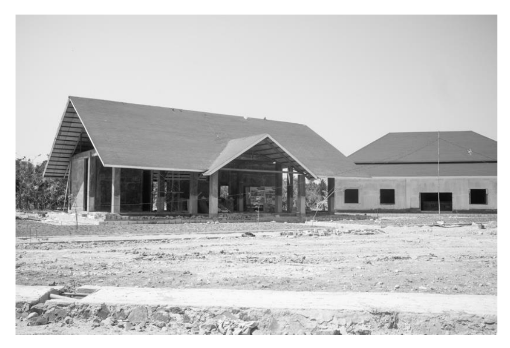
Figure 3. Modern Facilities Developed within the Hamlet