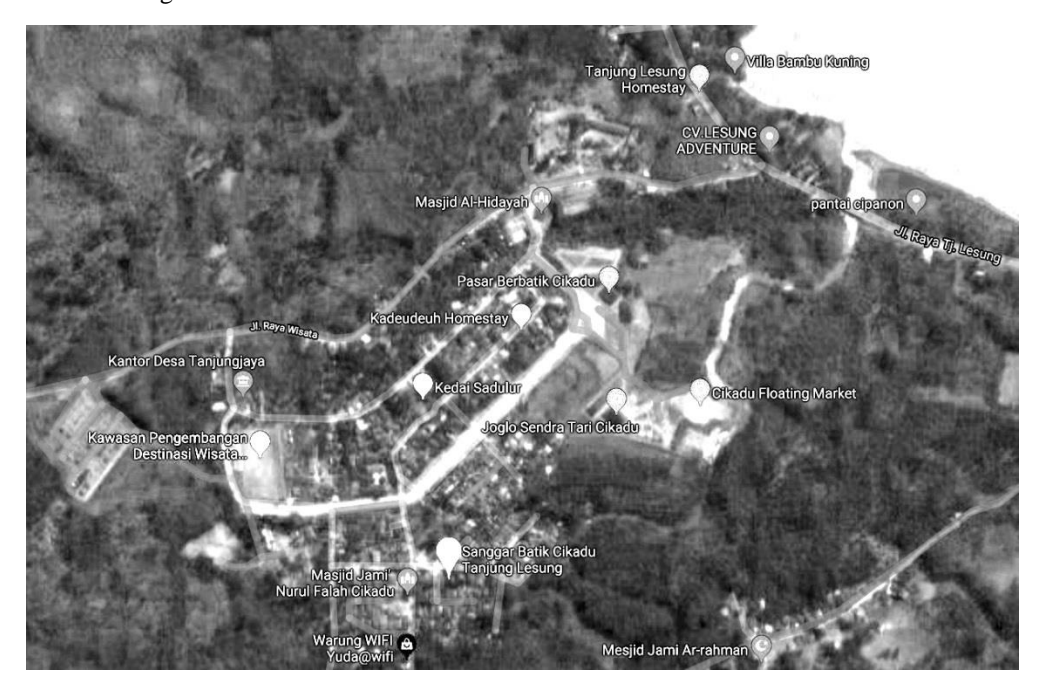
Figure 2. Aerial map of Kampung Cikadu

Actually, the initial tourism activity reportedly was the tourists been sent by Tanjung Lesung Resort to have additional activities outside the resort and to experience the wonderful river in Kampung Cikadu. Initially, the tourist activity went acceptably well. Until in recent months, there is one incident that leads to a tourist demise. Thus, the resort restrains its operation in sending the tourists to have activities in Kampung Cikadu. Nevertheless, the Batik Cikadu is still in demand to be visited by several tourists. Even though tourists from the resort are holding back for a while, but domestic tourists from other sources like government officials, schools, and corporate are quite many who visit Kampung Cikadu, mainly to visit the Batik Cikadu. In addition to that, according to the observation, it is indicated that the incident isn't the only factor that restrains tourists visit from the resort. From the tour operation point of view, there are several factors that need to be improved in order to keep the tourist from the resort visiting the hamlet.